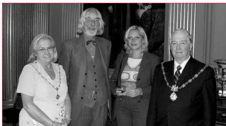
EuroGenGuide meets the Lord Mayor of York