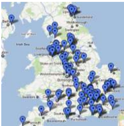
Map showing members location

It's been a busy few months for SWAN UK since our first newsletter came out. Word is spreading about the support we offer and our community of families continues to grow.