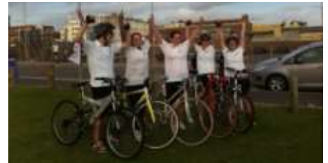
The SWAN UK bike team at the London to Brighton finish line

Also in September the project Advisory Committee met for the first time. Made up of parents and professionals, the meeting was a great success with lots of discussion about work we can do in the coming