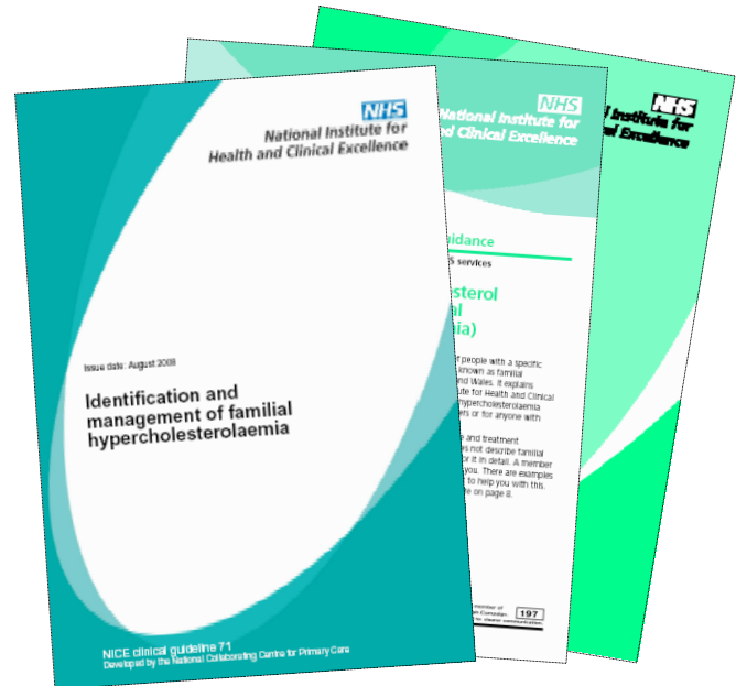
NICE guidelines publications for FH