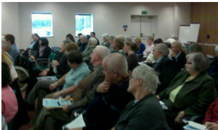
Discussions at the North Wales Neurological Discussion Da

The Neurological Discussion days were targeted at people with a neurological condition, their families and carers and held in Wrexham and Bangor in April and October, respectively. The days were aimed to provide information about the role of the Walton Centre and the links with community services. Over 140 people attended the events. Speakers included people with a neurological condition, Consultant Neurologists, Specialist Nurses, The Neurosupport Centre, Liverpool and members of the local Alliances.