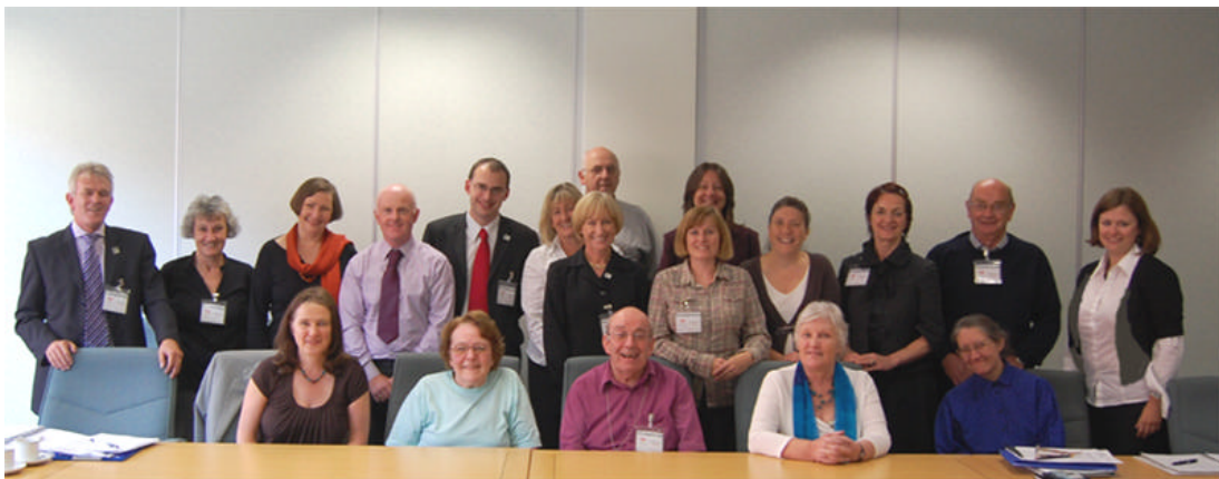
Wales Neurological Alliance meeting in 2008